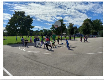
Extra Recess Reward