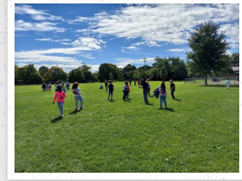
Extra Recess Reward